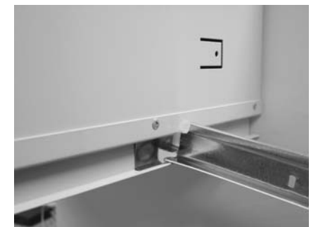
Figure 2. Grid Installation